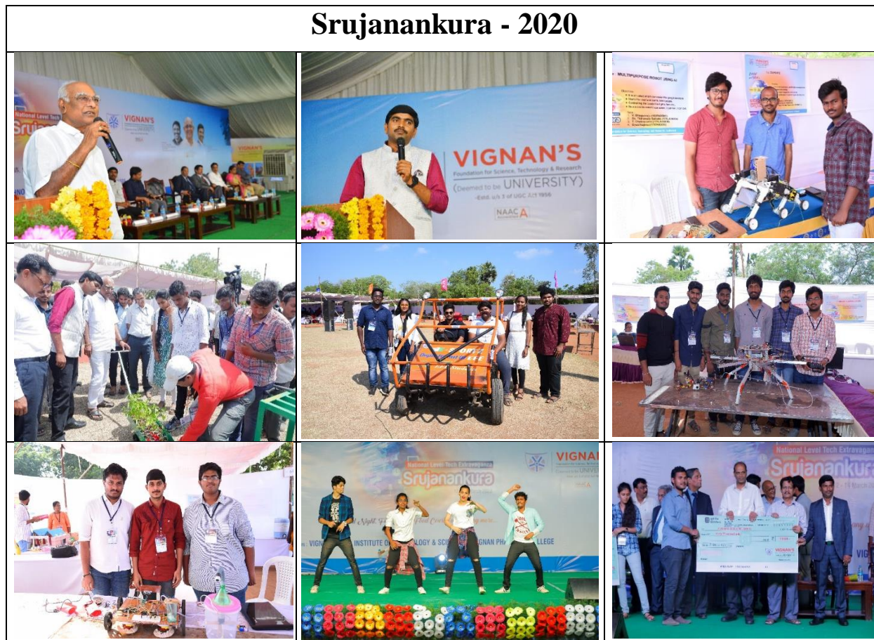
PHOTO GALLERY Srujanankura - 2020

Coconut Harvesting Robo and Multipurpose Robo using AI were very unique. Students were motivated to develop a scientific fervor and research mindedness attitude in order to develop the qualities of analytical and critical thinking, where all the students of VFSTR had exhibited 395 projects at the Expo and explain about their project that they had done. Any project that relates to any topic of the specified streams was allowed in this project expo. The judges appreciated the students. They asked students about the scientific concepts forming the foundation of the models. The organization of the competition and the efficiency of the volunteers can be proved to be outstanding as various tracks – prototype, poster, and quiz have proceeded in parallel. Refreshments and a grand buffet lunch were served on both the days of the competition. Volunteers also ensured that students from far away distances were escorted to the competition venue and provided with good hospitality by arranging proper transport facilities and staying at the hostel of the institute's. Details of student participation in the events such as Project Expo winners and the participant's list is given below.